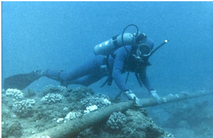
Picture 3. Diver during inspection of underwater cable

Sabotage activities of undersea cables can affect critical economic and financial national and interstate affairs. Also, undersea cables can be vulnerable to intelligence and espionage actions by states, groups, and individuals by compromising electronic data, and those activities are a threat to political stability and order of states and they can compromise international relations (DNI, 2017) ; (Matis, 2012).