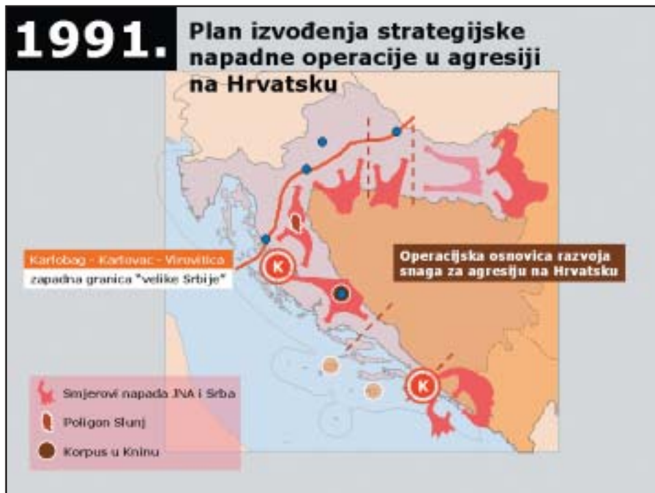
Picture 8: The plan of the Serbian strategic attack operation in the aggression on Croatia. - Graphic published in Adm. Domazet-Lošo's book "Hrvatska i Veliko Ratište"