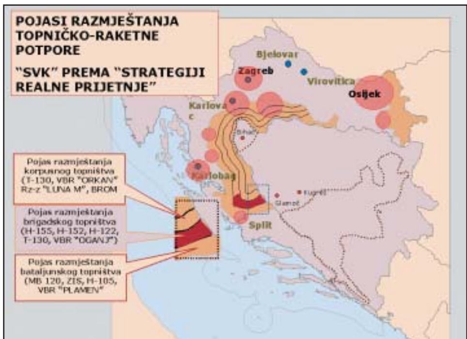
Picture 10: Dislocation of "RSK artillery - rocket" support of the real strategy threat. Maps published in Adm. D. Domazet-Lošo's book "Hrvatska i Veliko Ratište"