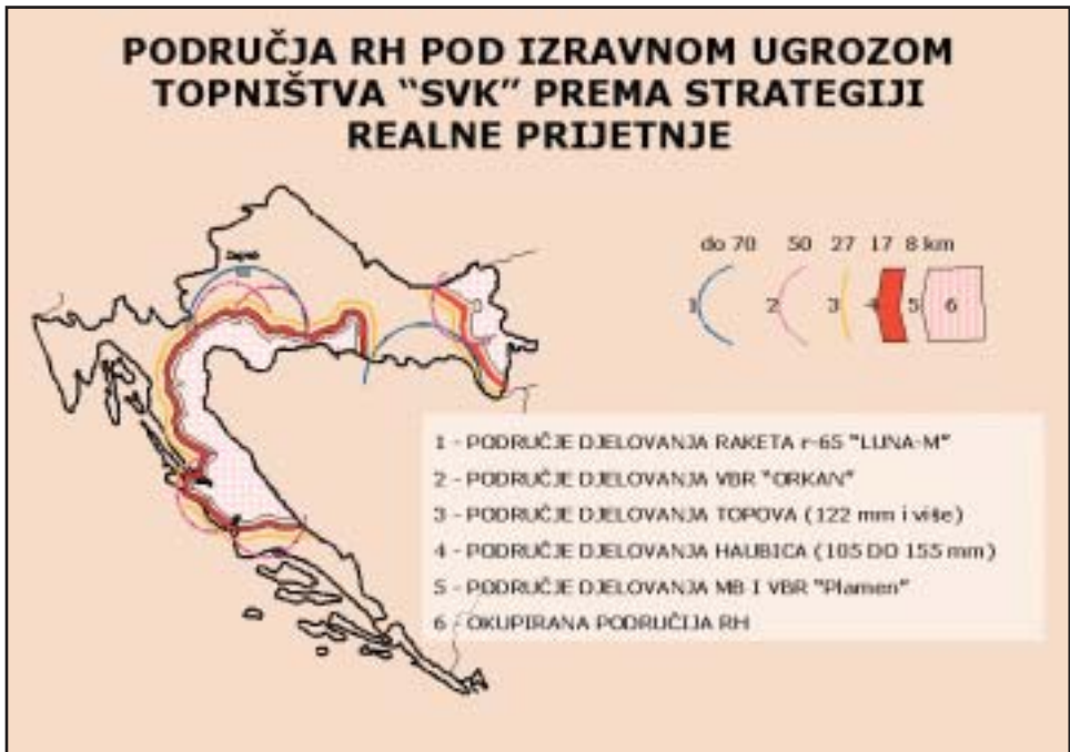
Picture 9: The real strategy threat - Croatian territory under the direct threat of "SVK" artillery